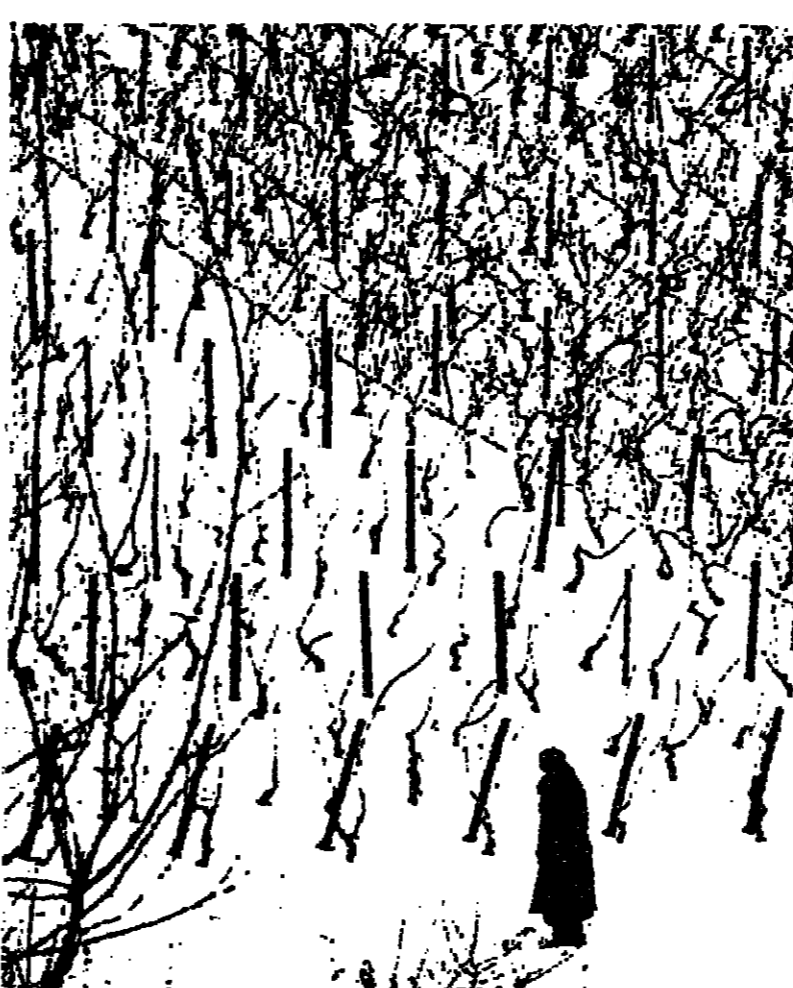
A man strolls through a snow-covered vineyard yesterday in Bad Kreuznach, West Germany. The area, known for its white wine, is in the grip of the below-zero weather now widespread in Europe.